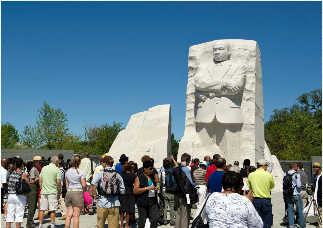
The Martin Luther King Jr. Memorial in Washington, D.C., is a reminder of Dr. King's message of love and tolerance.

Until people can look past what they see on the outside of a person, I do not think Dr. King's dream has come true. Fortunately, I do believe that one day it will.