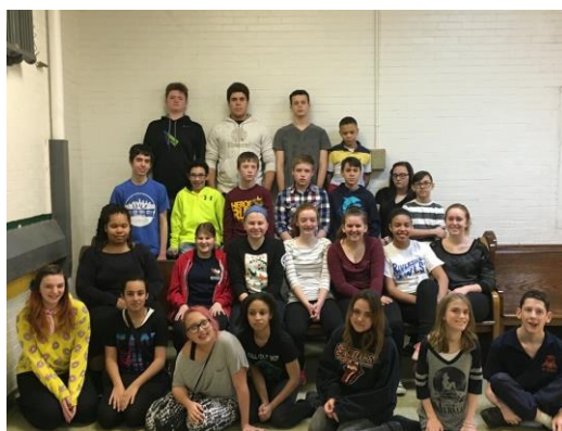
8 th Grade DC Trip