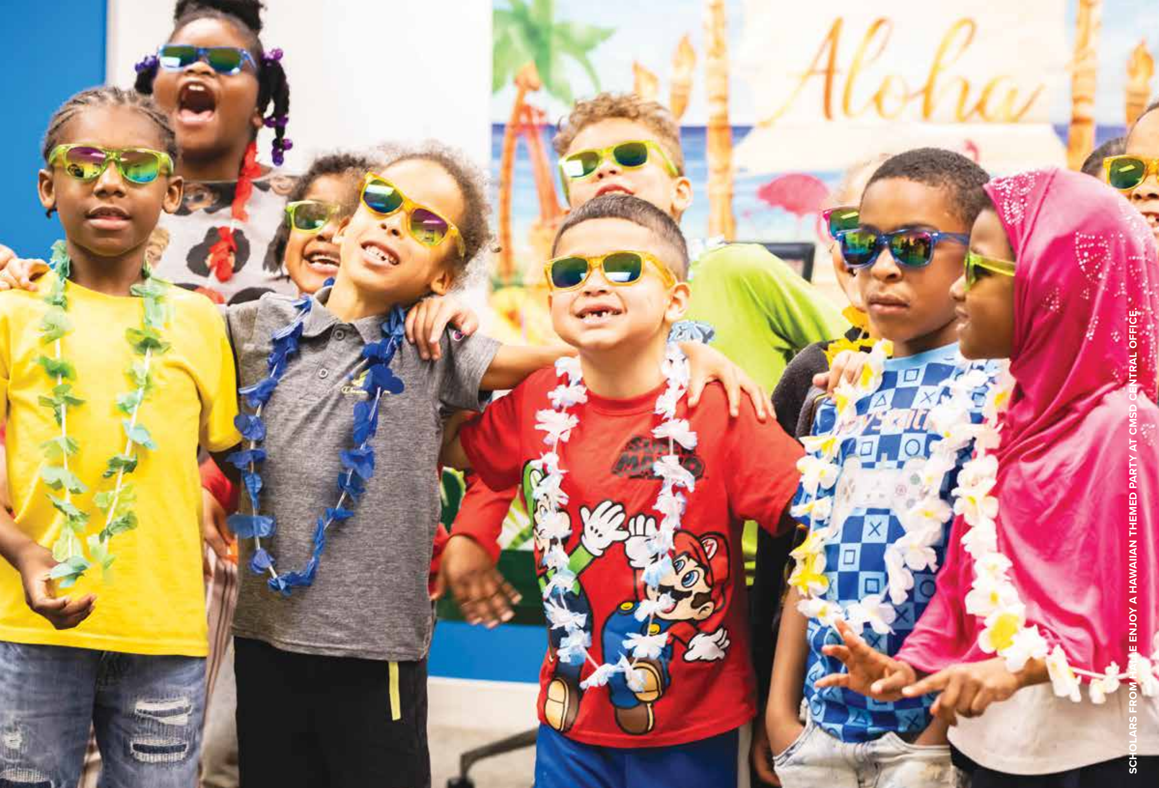
SCHOLARS FROM HOME ENJOY A HAWAIIAN THEMED PARTY AT CMSD CENTRAL OFFICE.

CMSD offers scholars engaging lessons that ensure equitable education.