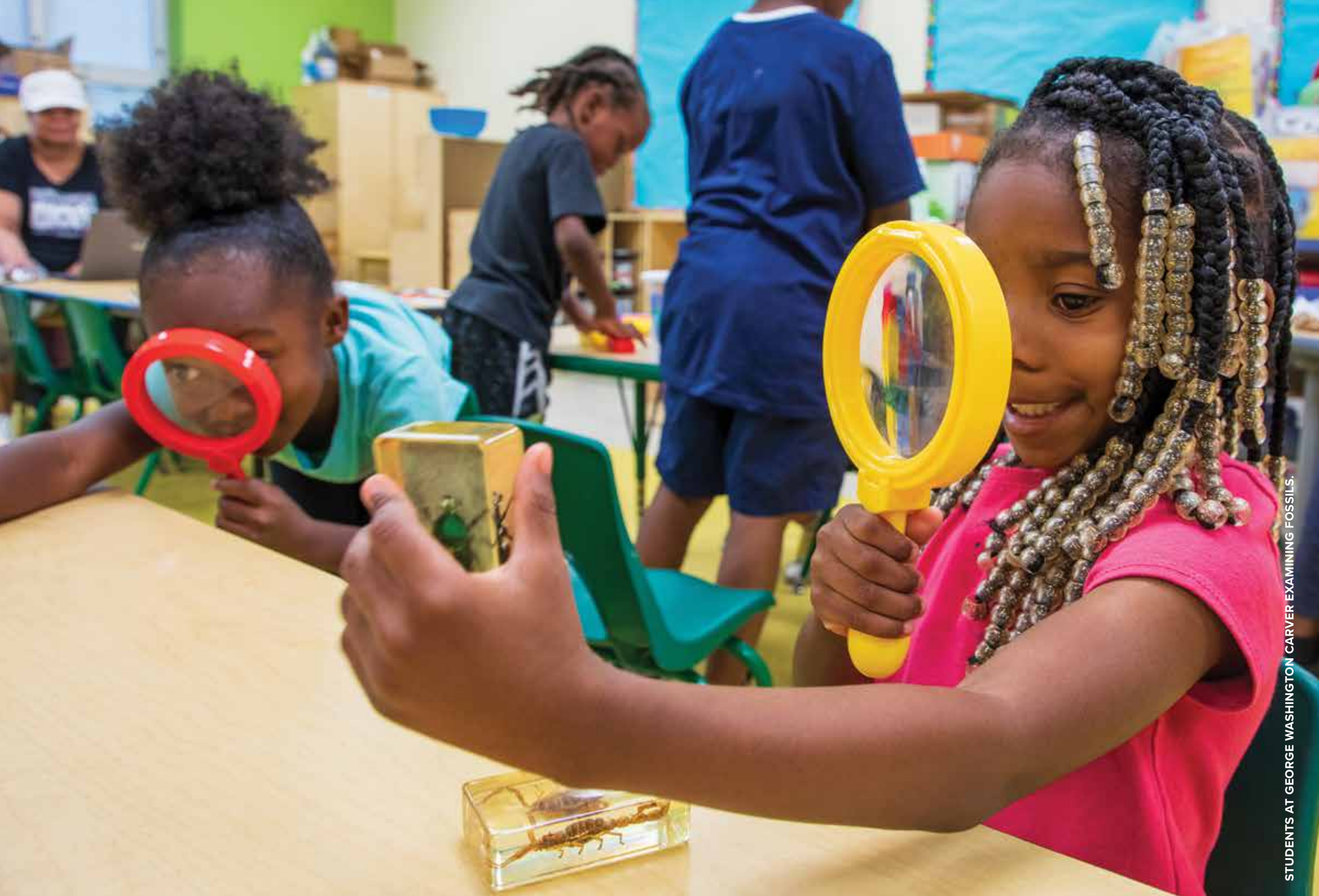
STUDENTS AT GEORGE WASHINGTON CARVER EXAMINING FOSSILS.

At CMSD, data-driven instruction ensures every scholar can access advanced coursework, fostering academic success.