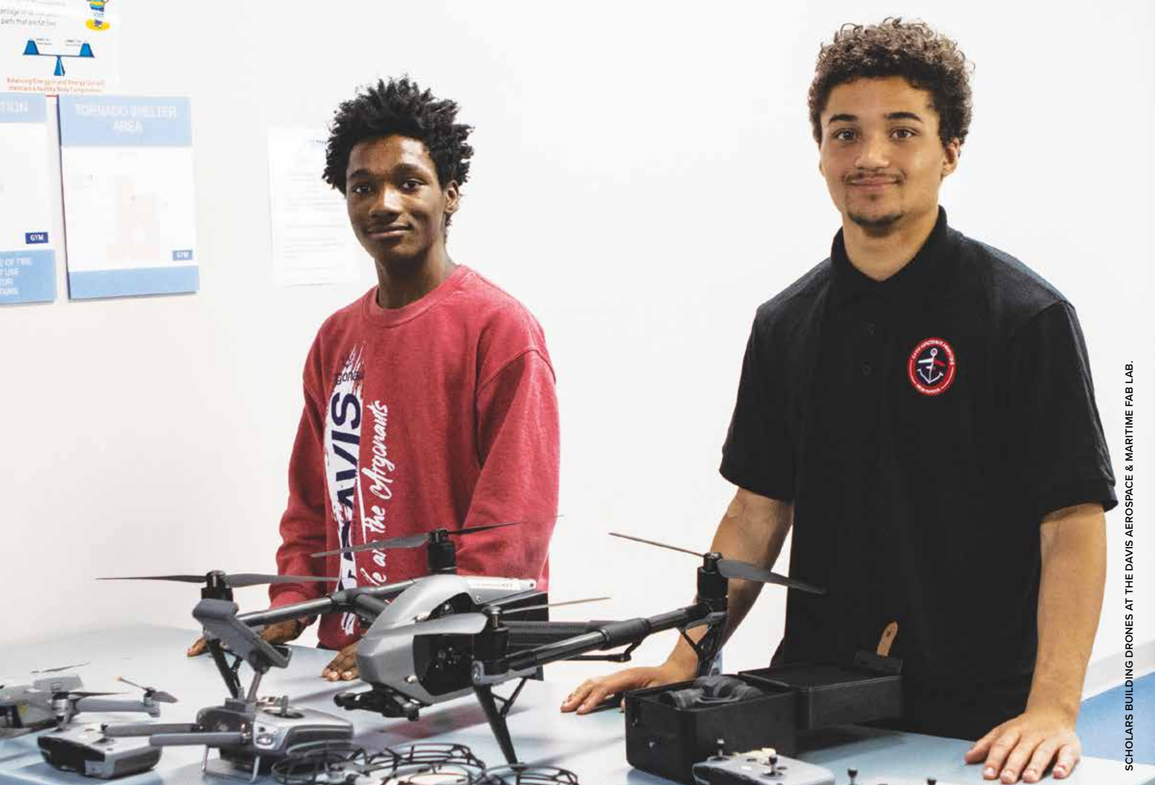
SCHOLARS BUILDING DRONES AT THE DAVIS AEROSPACE & MARITIME FAB LAB.

CMSD offers a robust, quality curriculum that includes hands-on practical experiences to prepare scholars for personal and professional success.