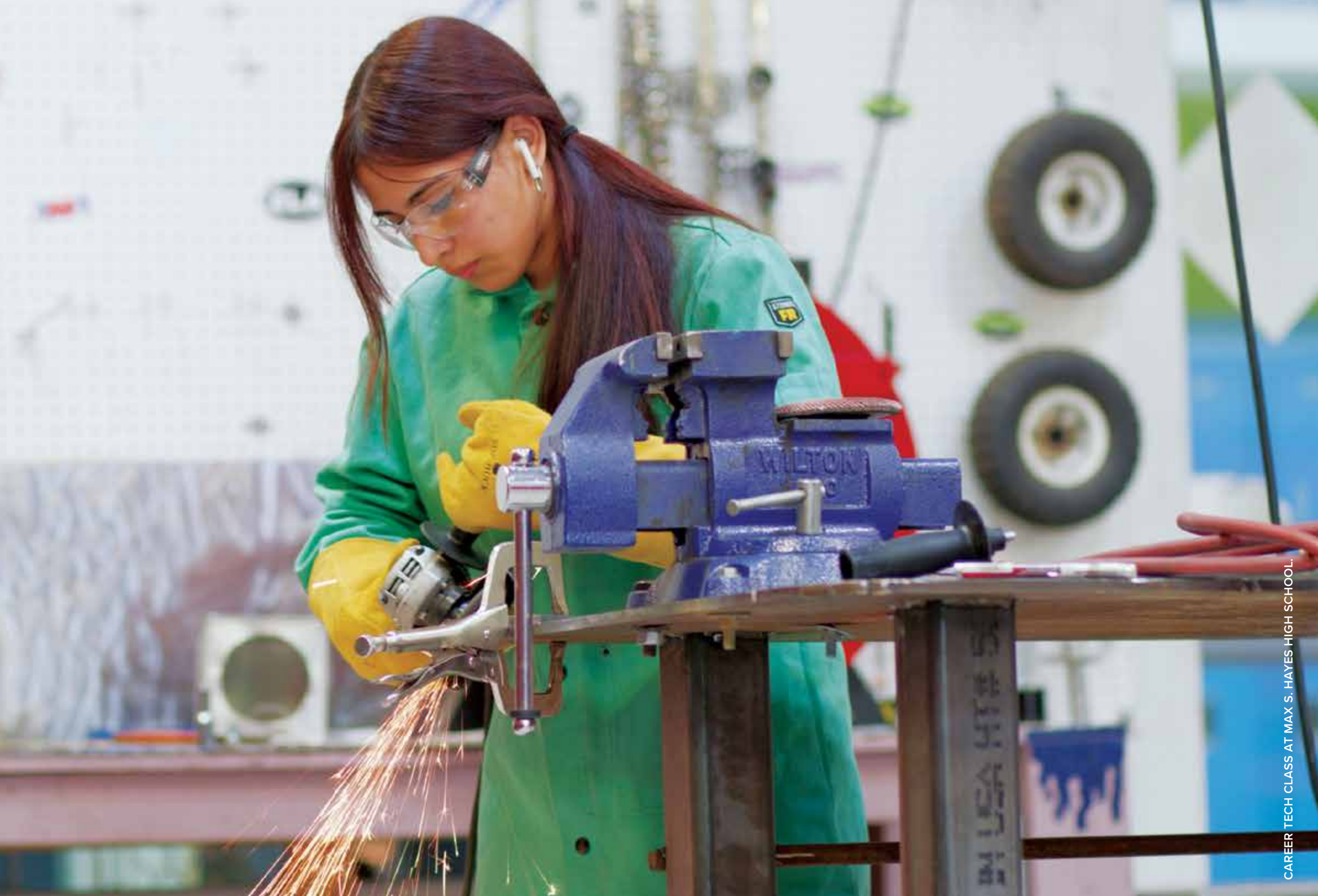
CAREER TECH CLASS AT MAX S. HAYES HIGH SCHOOL

Creating access to opportunities that guide scholars from their passions to career paths through programs including PACE and True2U is a priority at CMSD.