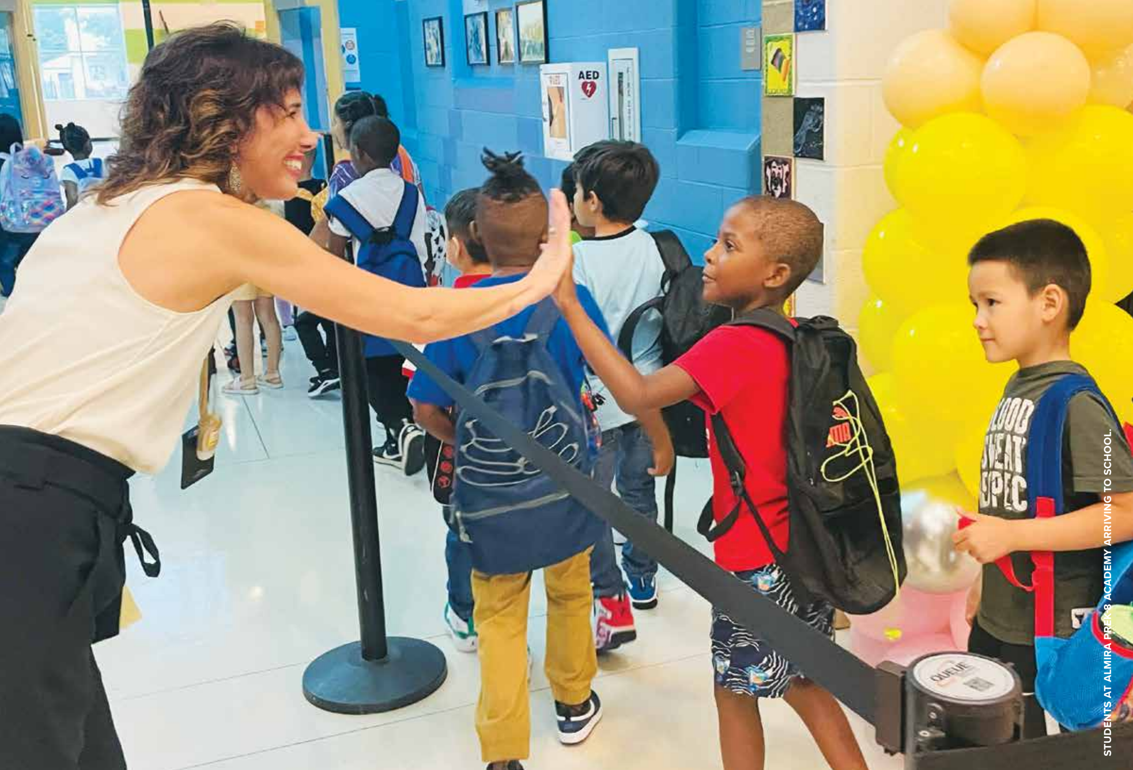
STUDENTS AT ALMIRA PRE-K 8 ACADEMY ARRIVING TO SCHOOL.

From the moment scholars enter the school buildings, their academic, social-emotional, and overall quality of learning are CMSD's top priority.