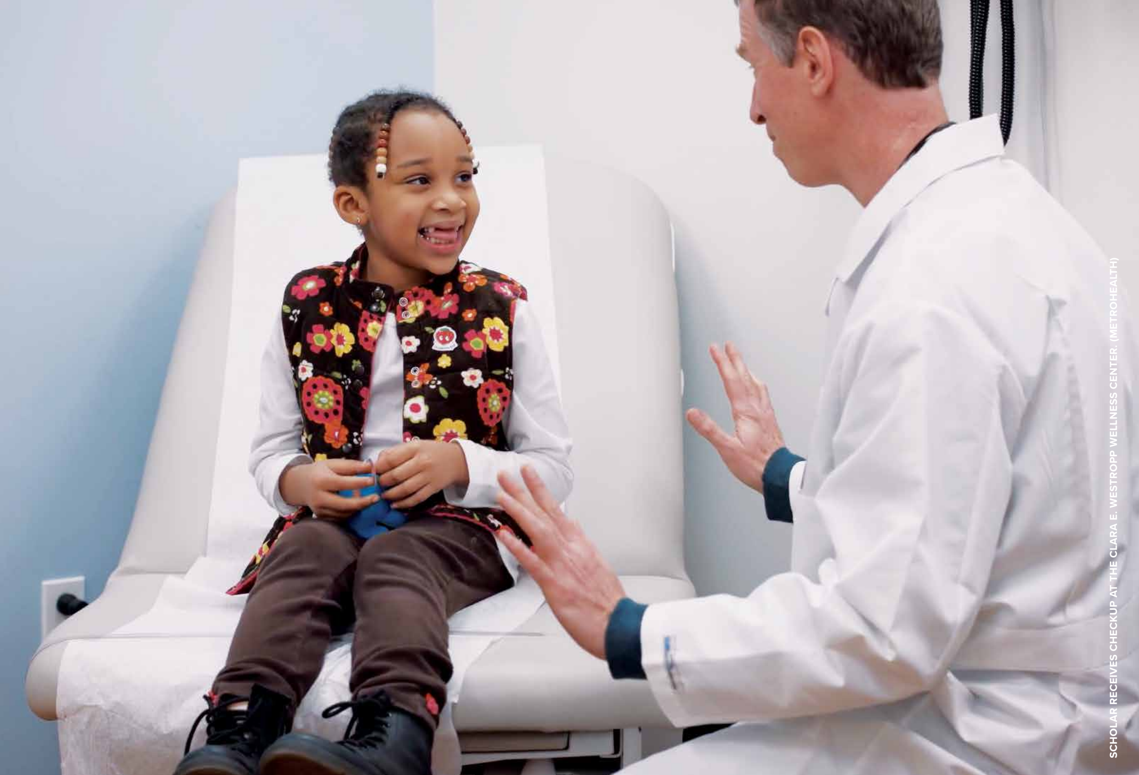
SCHOLAR RECEIVES CHECKUP AT THE CLARA E. WESTROPP WELLNESS CENTER.

CMUSD offers access to health services at schools to ensure that all scholars stay healthy and thrive in the classroom.