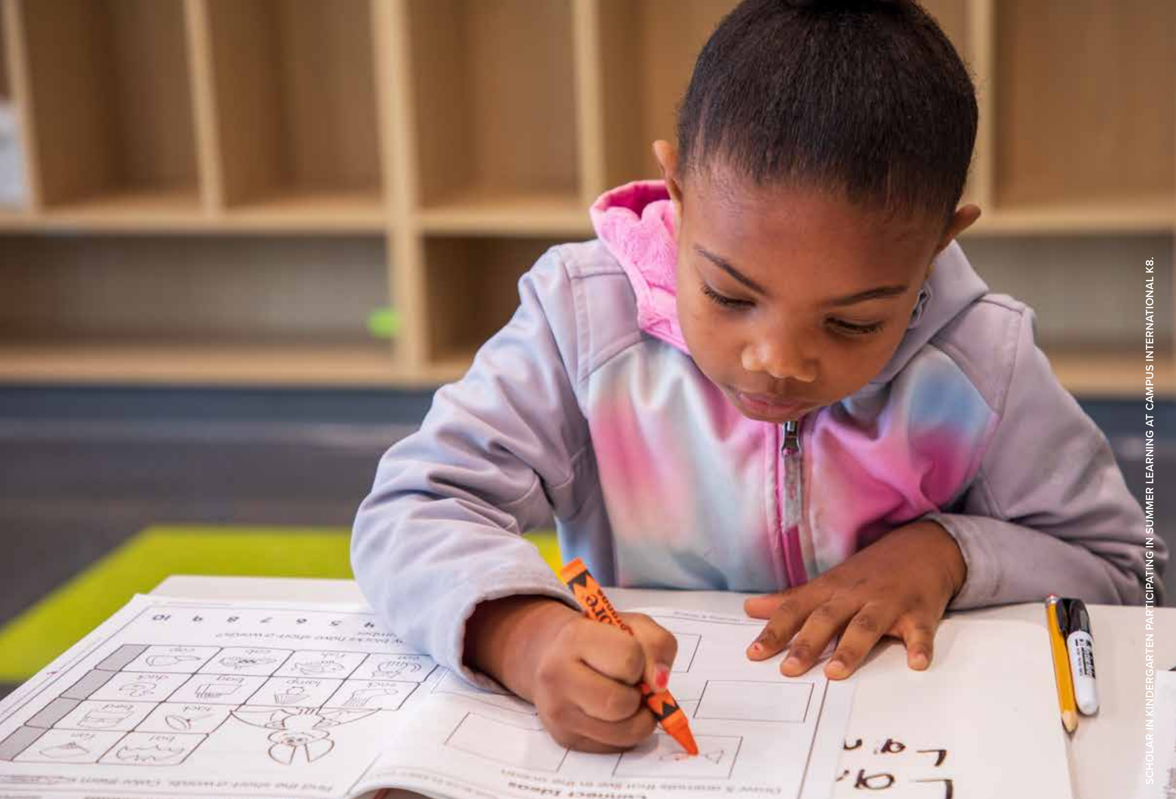
SCHOLAR IN KINDERGARTEN PARTICIPATING IN SUMMER LEARNING AT CAMPUS INTERNATIONAL K8.

CMUSD educators focus on ensuring every scholar's lessons are robust and engaging throughout their academic journey.