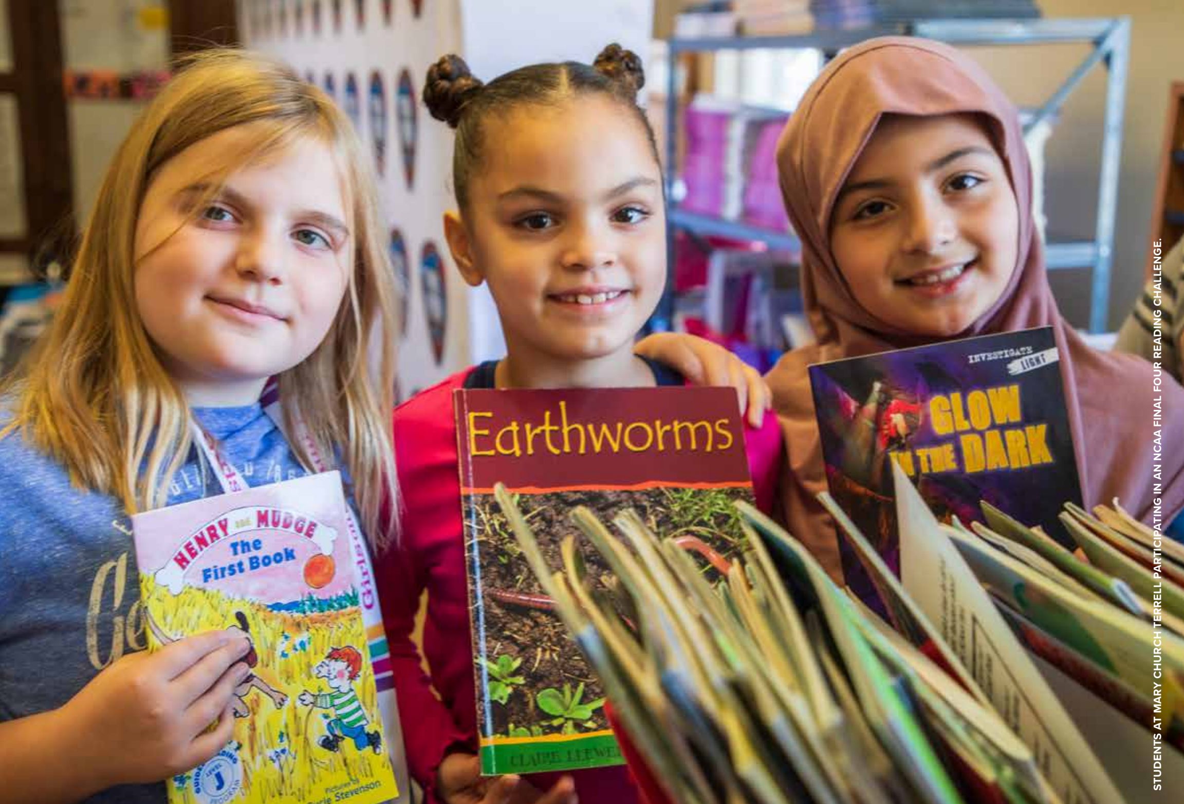
STUDENTS AT MARY CHURCH TERRELL PARTICIPATING IN AN NCAA FINAL FOUR READING CHALLENGE.

CMSD strives to offer a curriculum that reflects our scholars' diverse backgrounds to ensure every student sees themselves represented in their education.